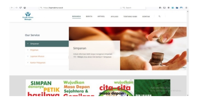
Fig 1. Initial Dislay

In Fig 1 it can be seen that the main view when opening the system. wherein this view is the view of the user who can only see notifications about the activities performed by CU. Glad that the main display can do our service to members. Where our services are conducted in the form of deposits, loans, special services, and service offices.